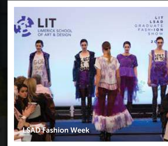
LSAD Fashion Week