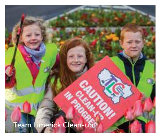
Team Limerick Clean-up